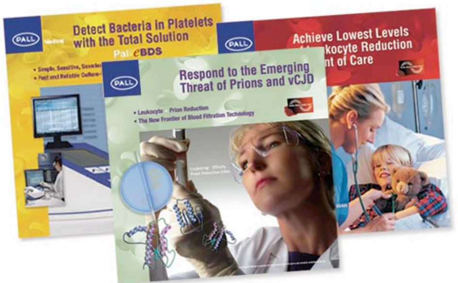
A few of the trade show booth panels designed by Creative Solutions for Pall Medical's international biotechnology trade show.

Driven to develop products of quality and distinction, Pall Medical leads the industry with unsurpassed innovation and state of the art technology.